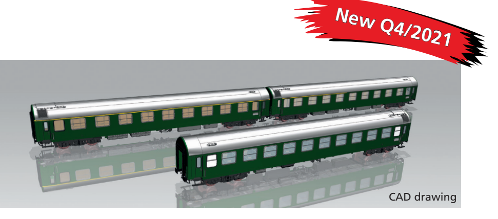
58220 Set of 3 "Y" passenger cars 1x 1st class car Ame'69, 1x 1st/2nd class car ABme'69, 1x 2nd class car Bme 69 D 300 DR IV

The compartment cars, often referred to as "Bautzen cars" because of their production location, were found in various versions. Several different car types make it possible to create a wide variety of block trains. In addition, two attractive three-car sets will be released this year. With the sleeping car, another distinctive car type is included. PIKO already has suitable locomotives in its program for the creation of prototypical train sets. The much acclaimed PIKO Expert model of class 132 #52760, often called "Ludmilla", is the ideal addition for the DR express train service in H0.