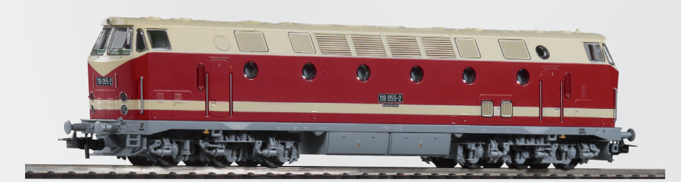
59930 Diesel Locomotive BR 119 DR IV 59830 ≥ Diesel Locomotive BR 119 DR IV