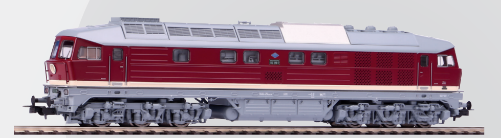
52760 Diesel Locomotive BR 132 DR IV 52761 ☐ Diesel Locomotive BR 132 DR IV